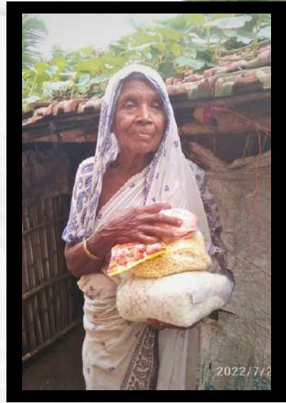
Sabar Community Food Program