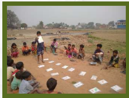
Brick-kiln Education Program for Migrant Workers