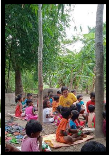
Sabar Community Education Centre